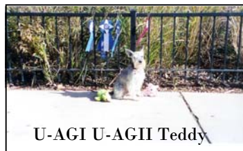
U-AGI U-AGII Teddy