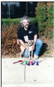
U-AGI U-AGII Lou